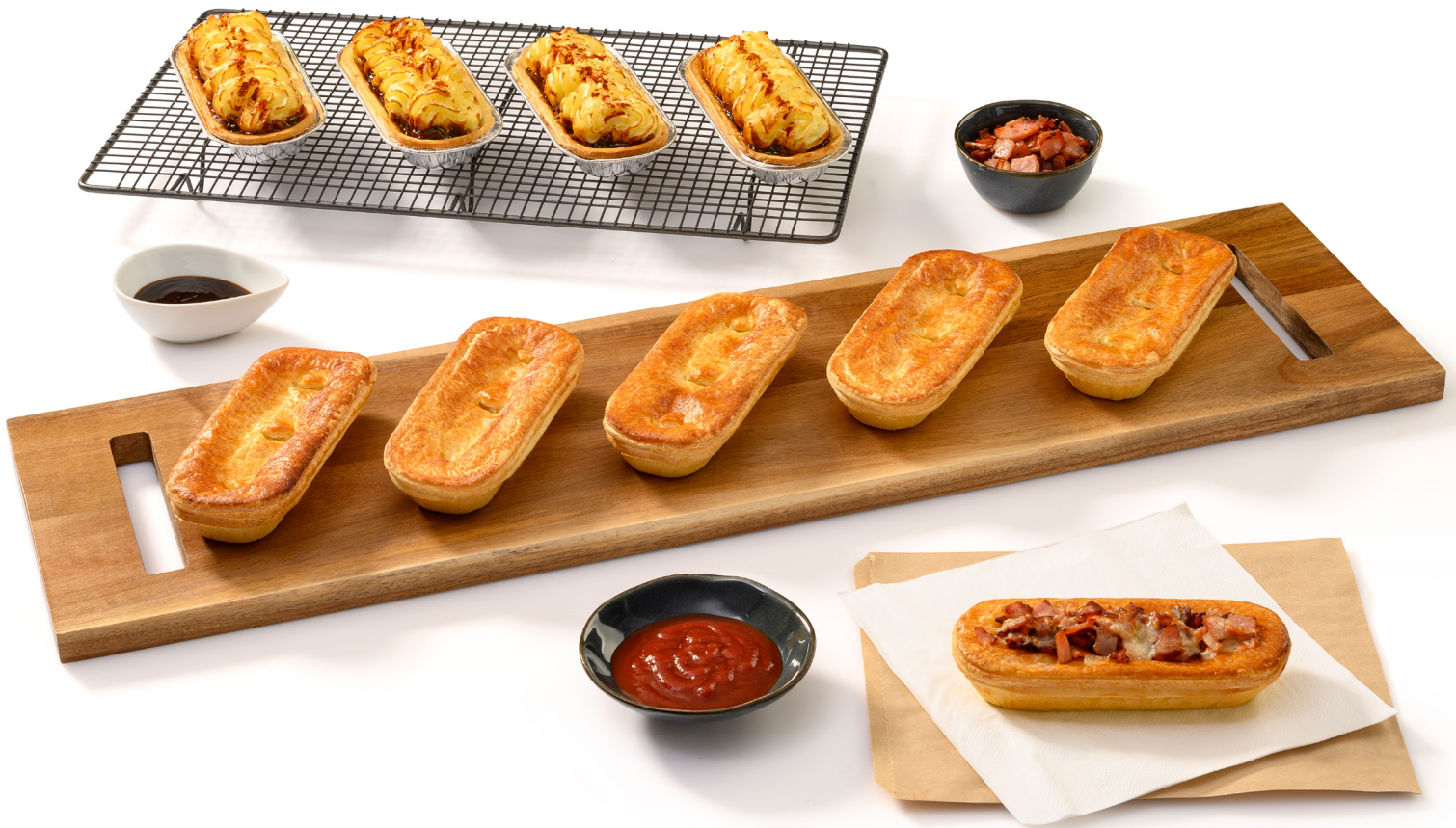
170mm Long Savoury Pie Shell