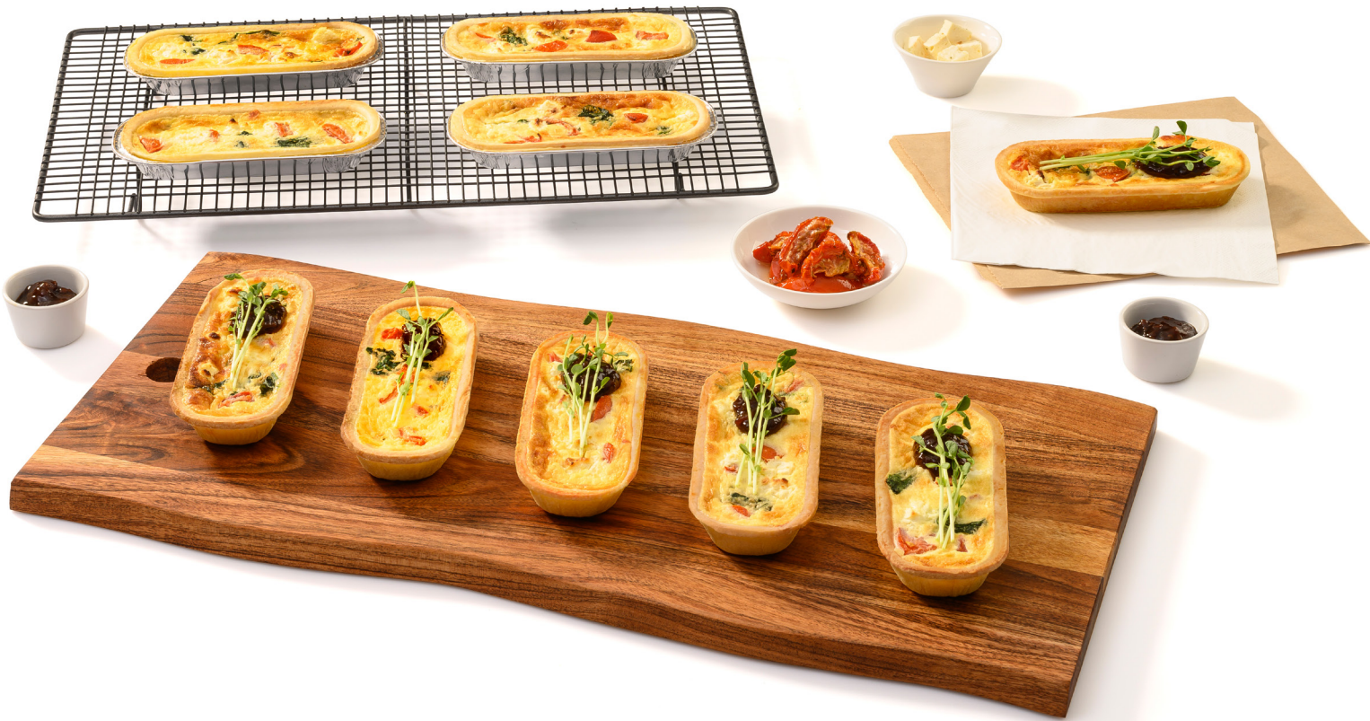
170mm Long Savoury Pie Shell