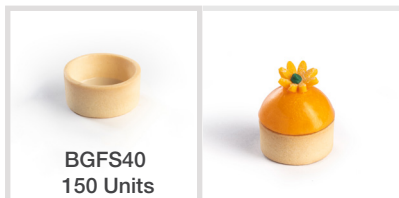
BGFS40 150 Units