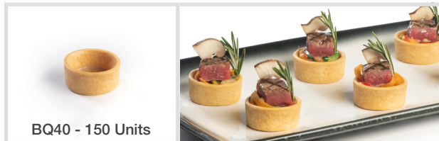
BQ40 - 150 Units