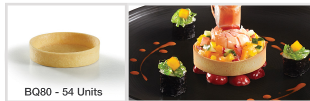
BQ80 - 54 Units