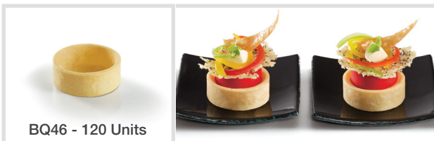
BQ46 - 120 Units