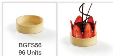
BGFS56 96 Units