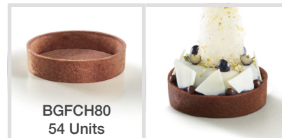
BGFCH80 54 Units