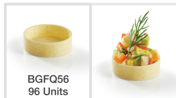
BGFQ56 96 Units