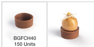
BGFCH40 150 Units