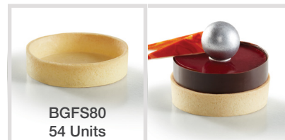
BGFS80 54 Units