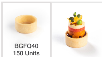
BGFQ40 150 Units