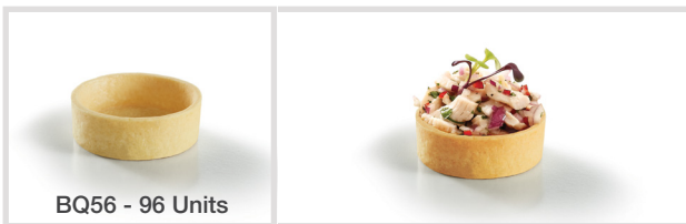
BQ56 - 96 Units