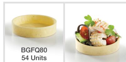
BGFQ80 54 Units

For more information on our complete range of products and services visit: