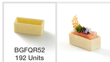
BGFQR52 192 Units