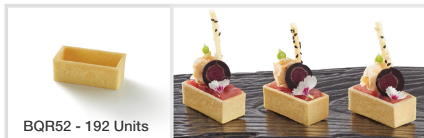
BQR52 - 192 Units