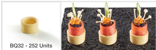
BQ32 - 252 Units