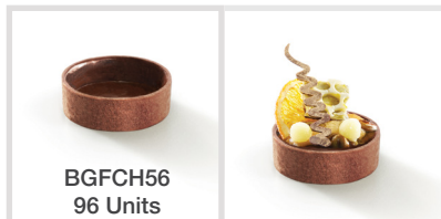
BGFCH56 96 Units